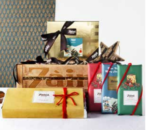
Box 20x30x15 composition of 45 €